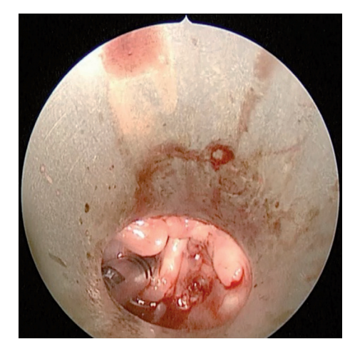
Figure 3. Laryngeal view after surgical excision of the cyst