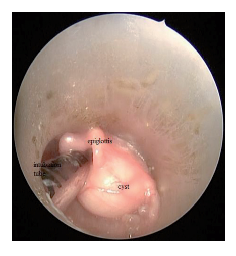
Figure 2. Endoscopic view of the cyst in the larynx